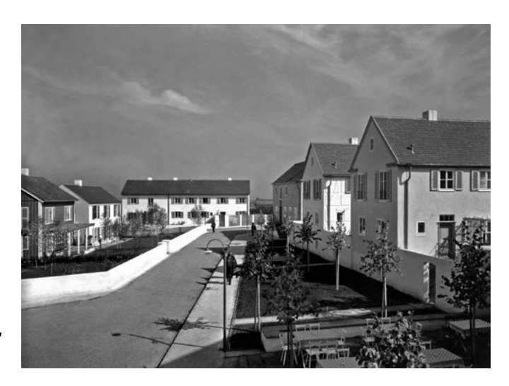
2 Exhibition German Timber for Utility and Home, Kochenhof Estate, 1933, Stuttgart, Photographer: Franz Fels

that had to be rethought. Cooperatives changed from merely providing housing as a social welfare service and asked themselves: Why is the infrastructure disappearing? In the past, we as a cooperative only did residential work. Commerce and work were as far away as possible – similar to the Weißenhof – and now we see ourselves as gardeners of a public space, curating, facilitating, designing. There's work coming in, neighbourhood infrastructure, why isn't your shop working? What could we do to make it work? Together with the question of forms of living: aging households, small households; how can we intervene in the generational cycles, so that older people move into accessible new buildings with small apartments and young families move back into the old building stock? In Stuttgart-Rot, a competition is currently being run by the municipal housing association SWSG, in which we, the IBA , are involved. The competition involves 300 apartments and housing for single men in need.