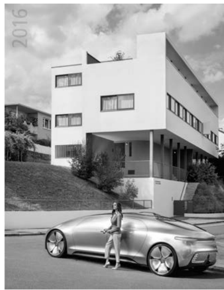
6 1927 / 2016

who, with the aid of technology, is establishing her own socially independent life, in her lightweight clothes, freed from bourgeois restraint, and who's now in control of this machine.