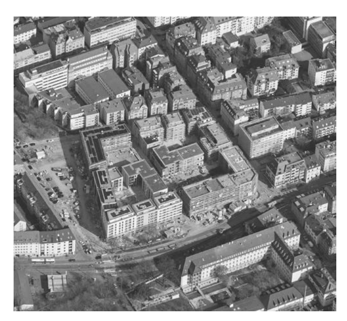
3 Olga-Areal, 2019, Stuttgart, Aerial view

Yes, perhaps we can play a role in precisely these discussions.