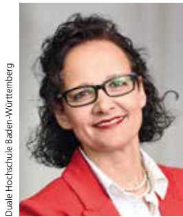
Duale Hochschule Baden-Württemberg